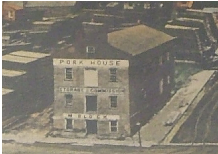
Portion of "1870 Muscatine 1950," Painting in City Council chambers, Bawden Bros., Inc., Davenport, IA, 1949.