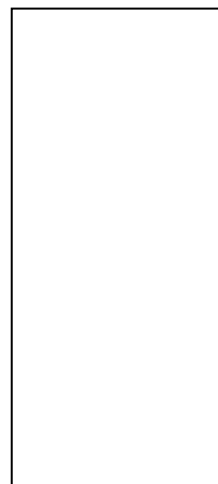
(front – W. 2 nd St)