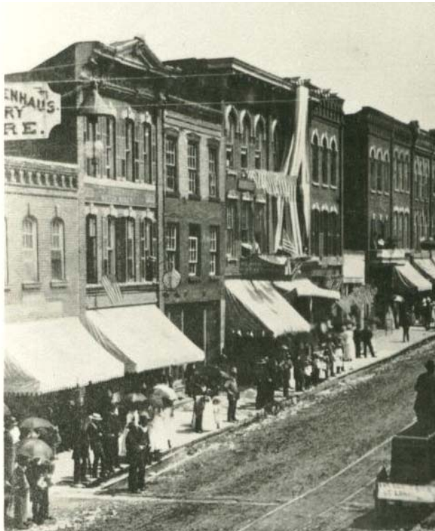
Portion of GR178 with 203 E. 2 nd St as the first full building on the left.

The C. Giesenhaus Building at 203 East 2 nd Street is a three-story, four-bay building constructed of running bond brick. The storefront appears to have been remodeled at least twice. The first, likely dating to the 1920s or 1930s (perhaps as late as c.1940), included the addition of the black and white vitrolite panels across the storefront frieze, now visible behind the removed non-historic awning. The metal storefront windows and door date to a more recent remodeling. There is also a historic entry to the right side of the storefront to access the upper stories. The second and third stories have historic single-over-single-light double-hung windows with segmental arch lintels with keystone detail with decorative star medallions. A continuous sill runs under both sets of windows. The decorative frieze/cornice with brackets extends across the façade between the decorative capitals of the brick pilasters. The name of the original owner, C. Giesenhaus, is centered on the frieze, and a triangular pediment above the name notes the construction date of 1882.