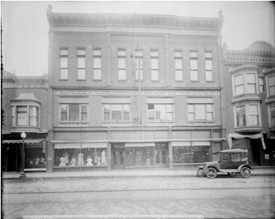
February 20, 1923 – Oscar Grossheim photograph Grossheim Collection, Musser Public Library Online through the Upper Mississippi Valley Digital Image Archive, #2766a http://www.umvphotoarchive.org/cgi-bin/viewer.exe?CISOROOT=/muspl&CISOPTR=1080