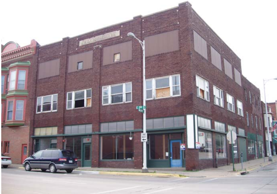
Photograph from June 2004