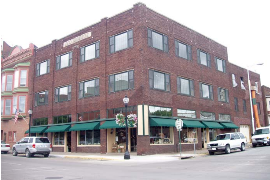
Photograph from June 2005