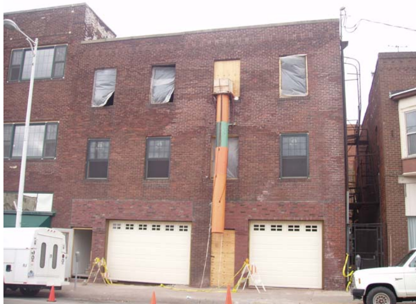
June 15, 2005