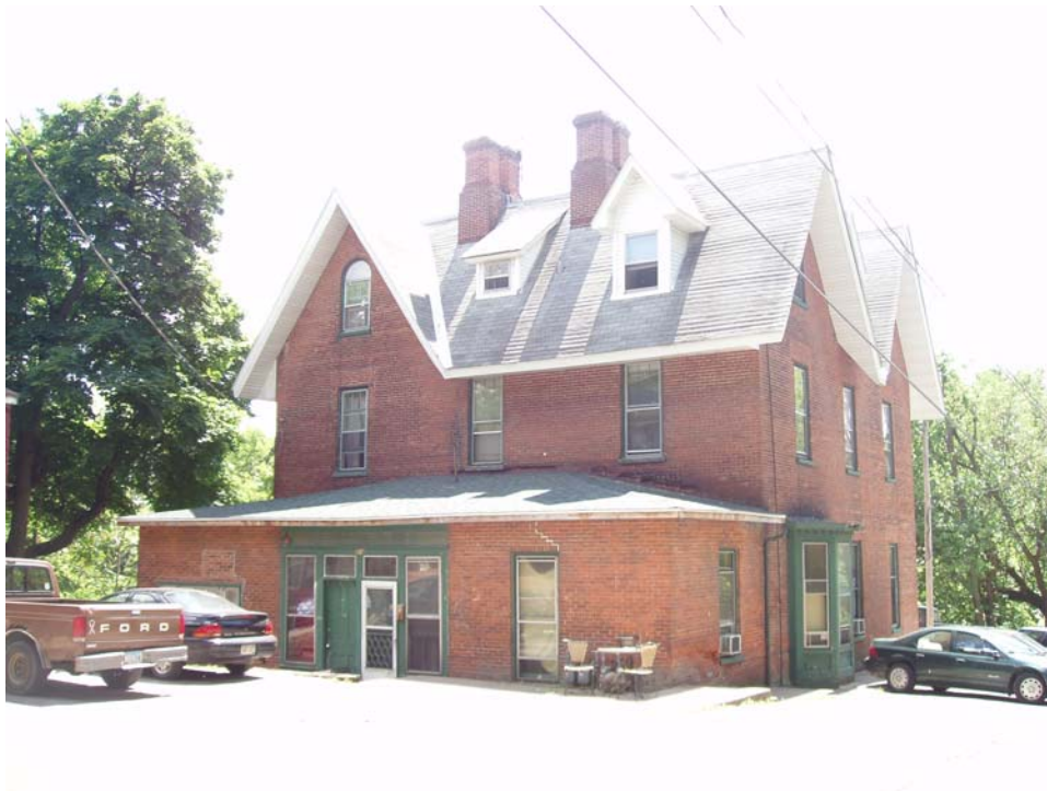
east side and "rear" of house