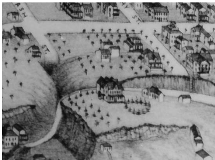
view of "front" of house from 1874 birds-eye view