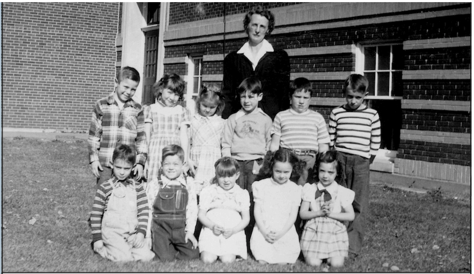
1st Grade Class, Nichols Public School, Nichols, Iowa - 1949