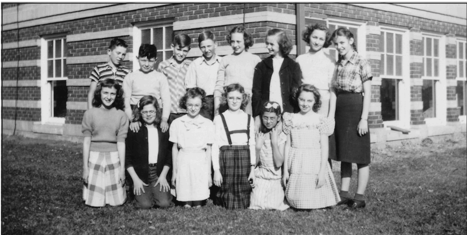
7th Grade Class, Nichols Public School, Nichols, Iowa - 1949