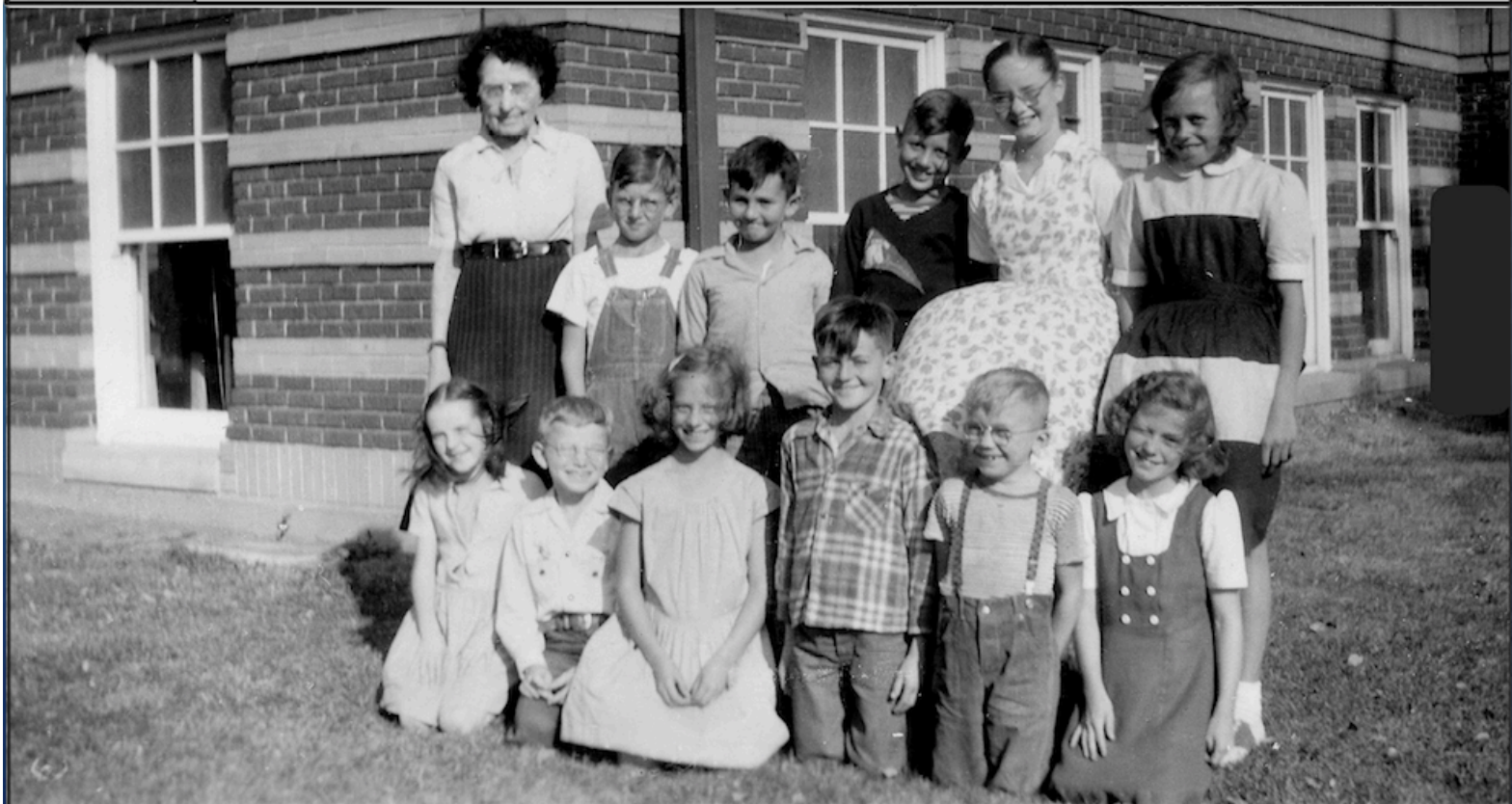
4th Grade Class, Nichols Public School, Nichols, Iowa - 1949