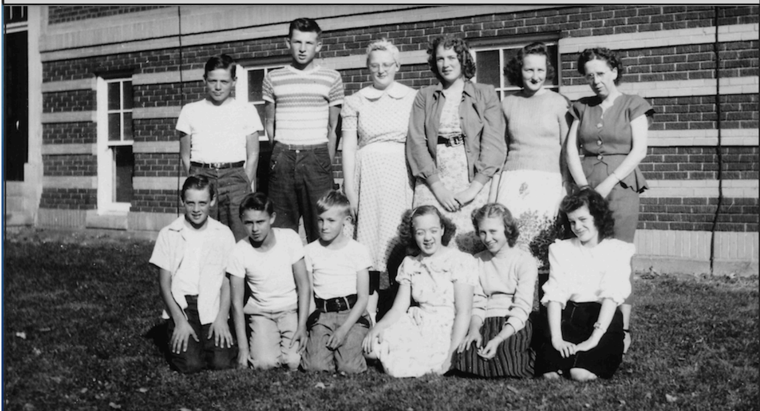
8th Grade Class, Nichols Public School, Nichols, Iowa - 1949