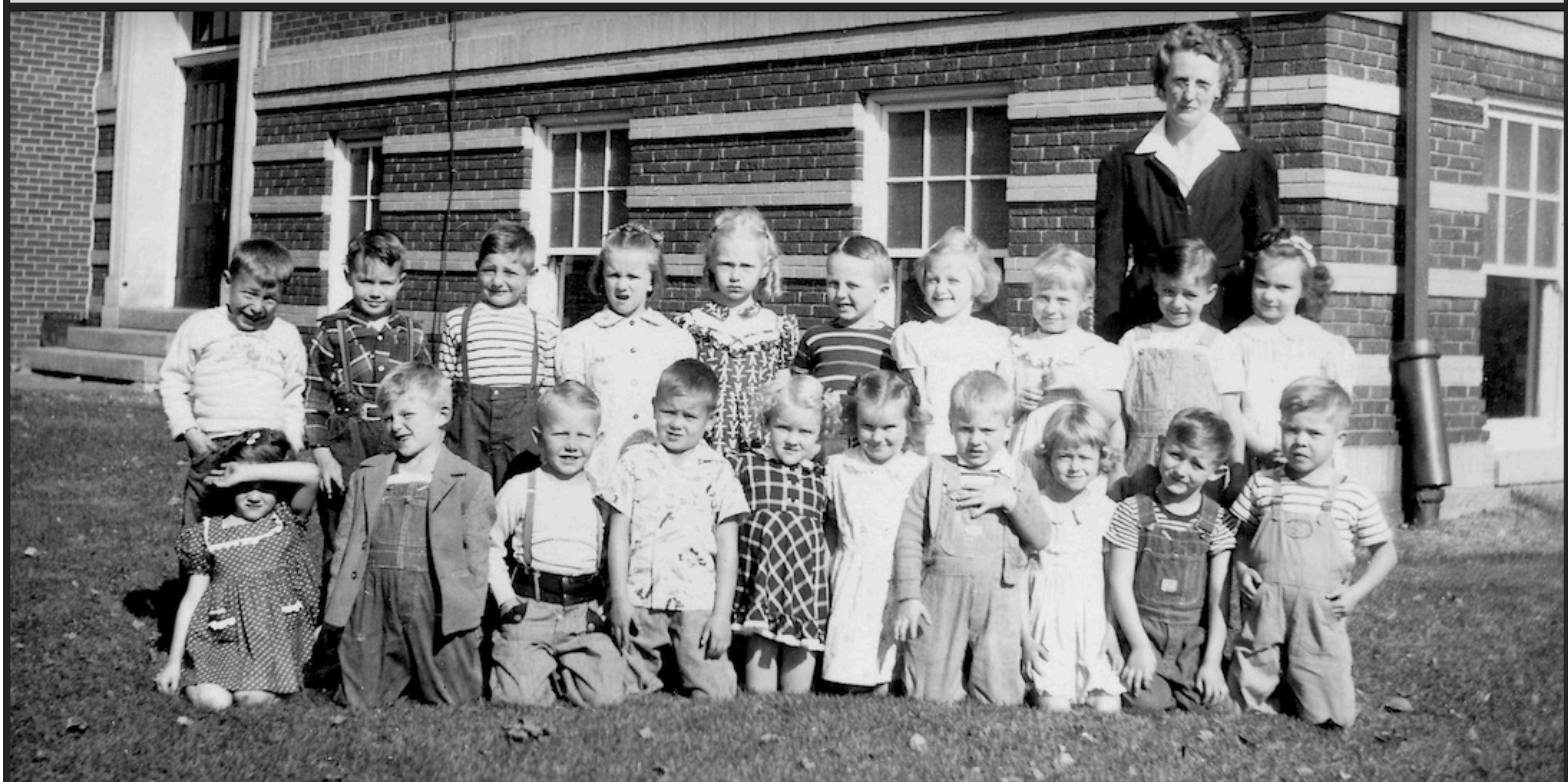
Primary Grade, Nichols Public School, Nichols, Iowa - 1949