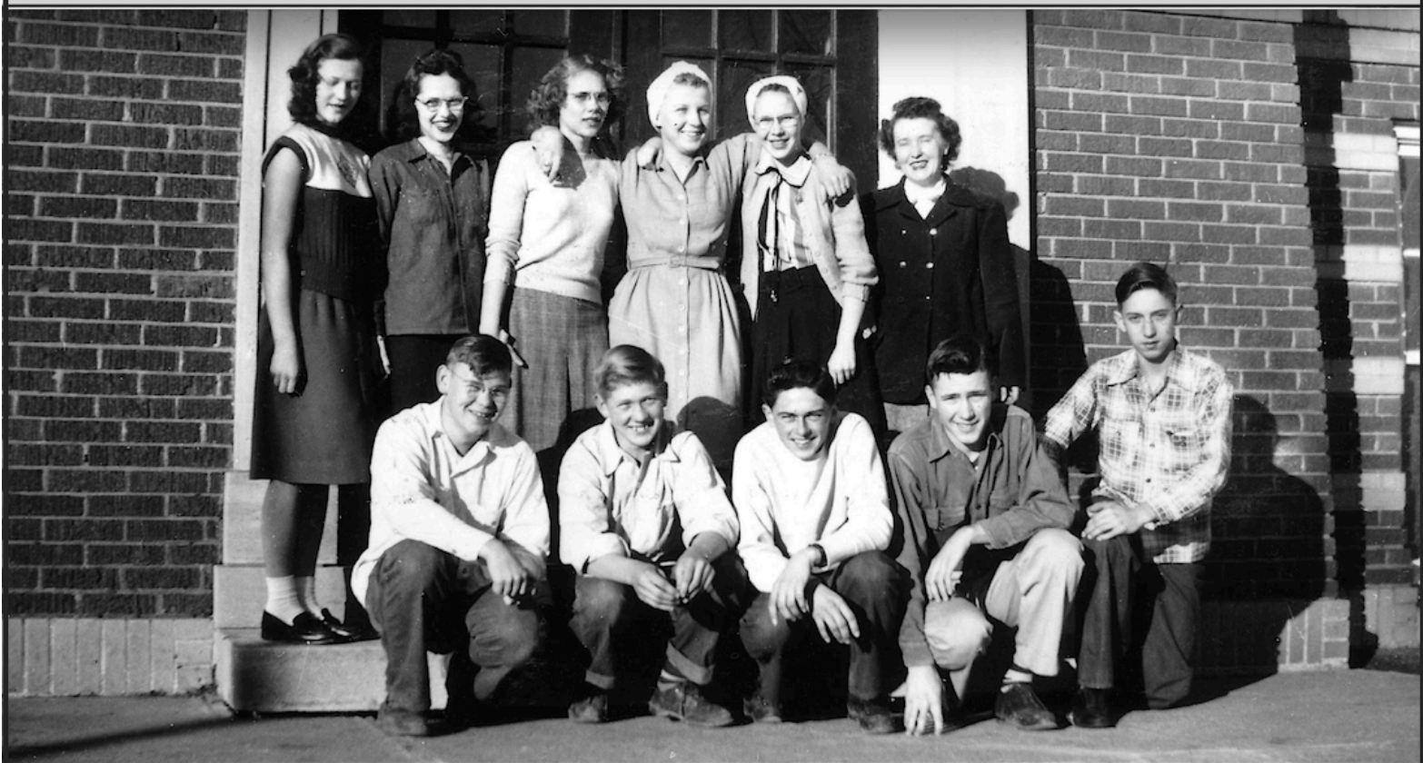
Staff of the NHS Mirror Yearbook — 1949