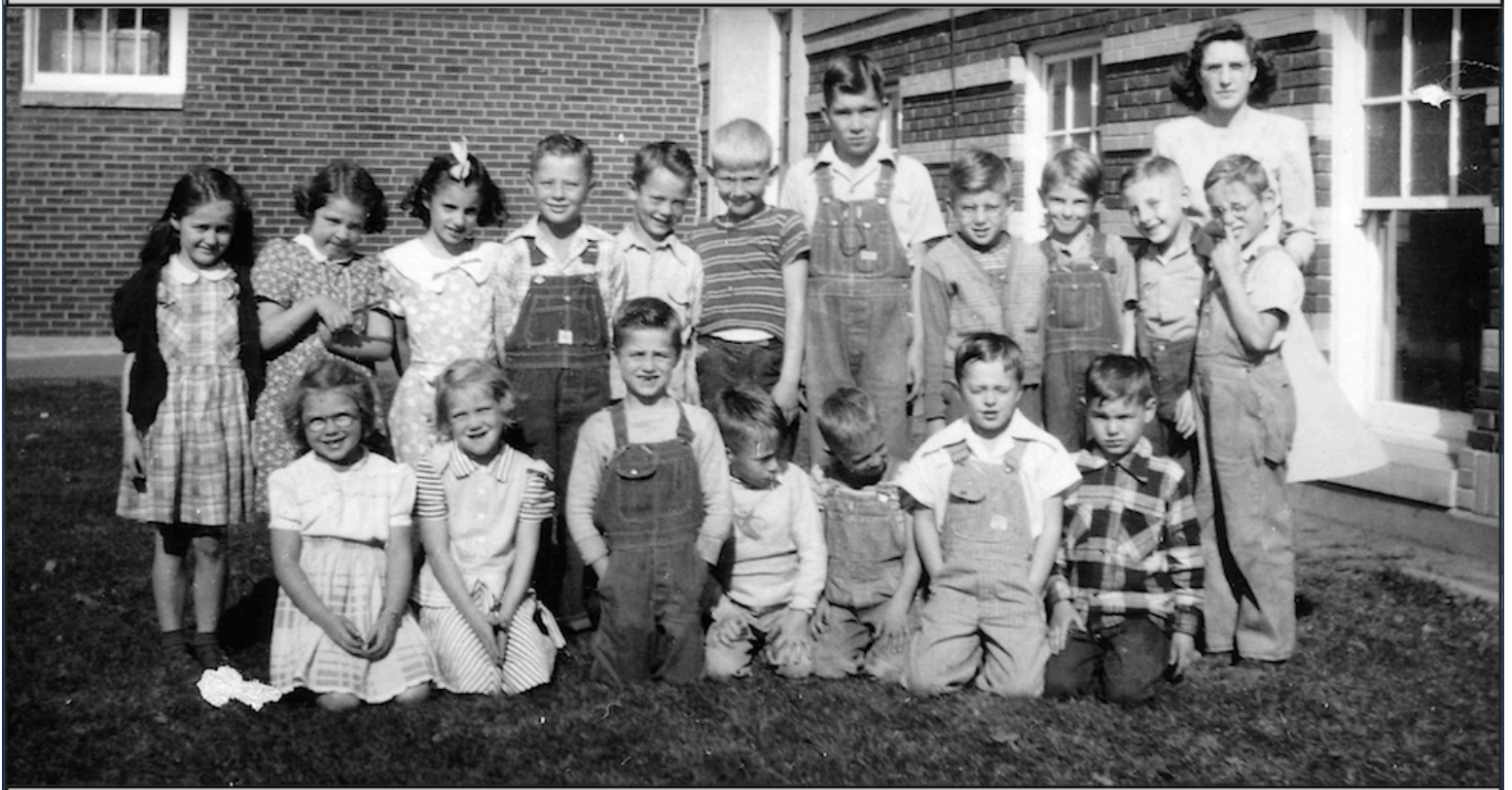
2nd Grade Class, Nichols Public School, Nichols, Iowa - 1949