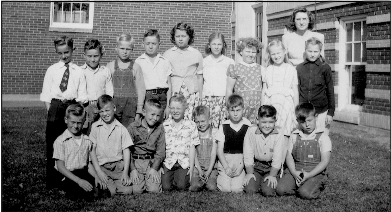
3rd Grade Class, Nichols Public School, Nichols, Iowa - 1949