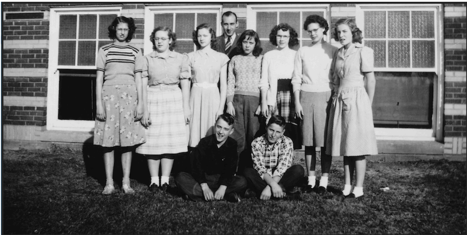
1949 Freshman Class, Nichols High School, Nichols, Iowa