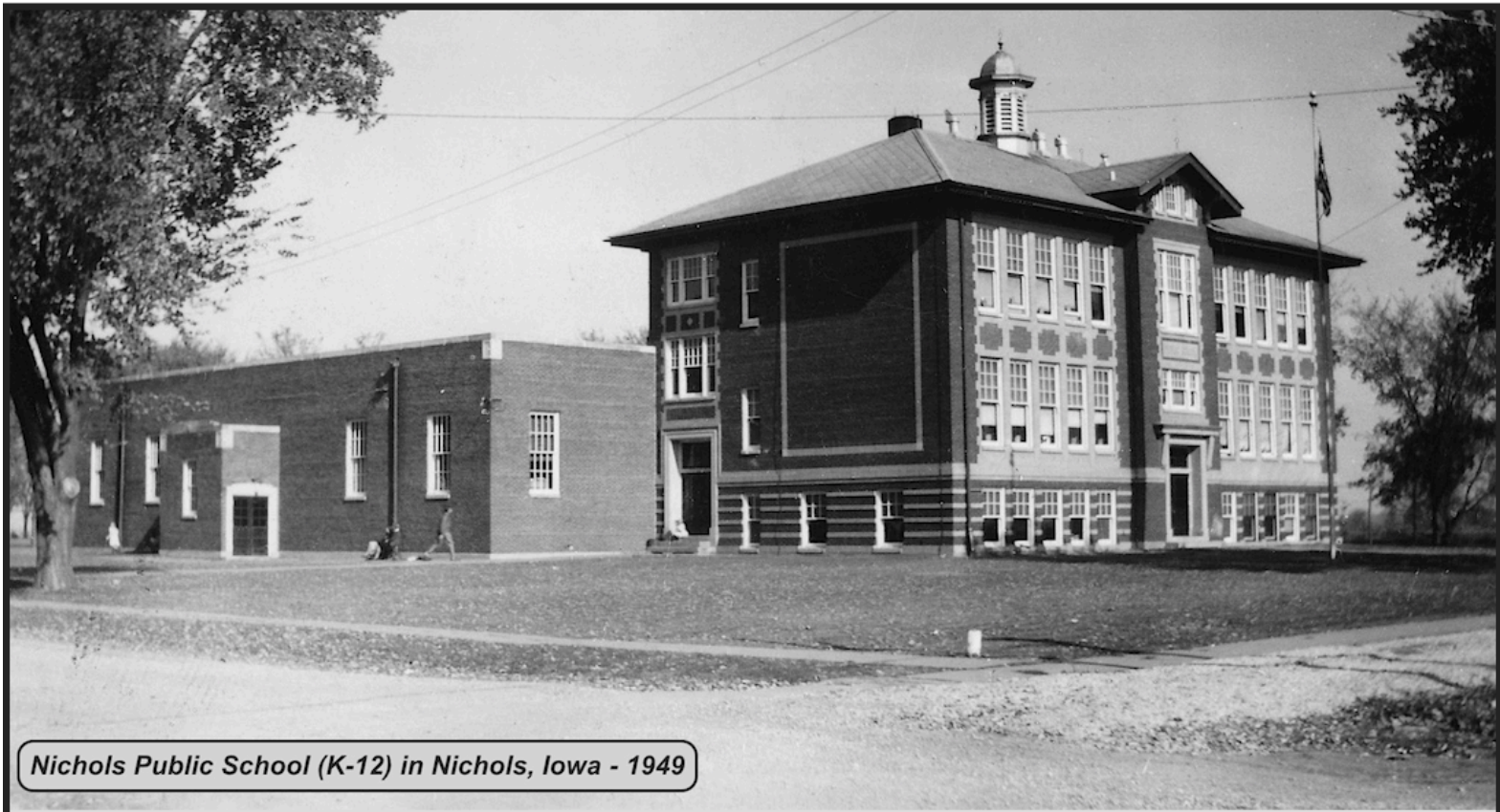
Nichols Public School (K-12) in Nichols, Iowa - 1949