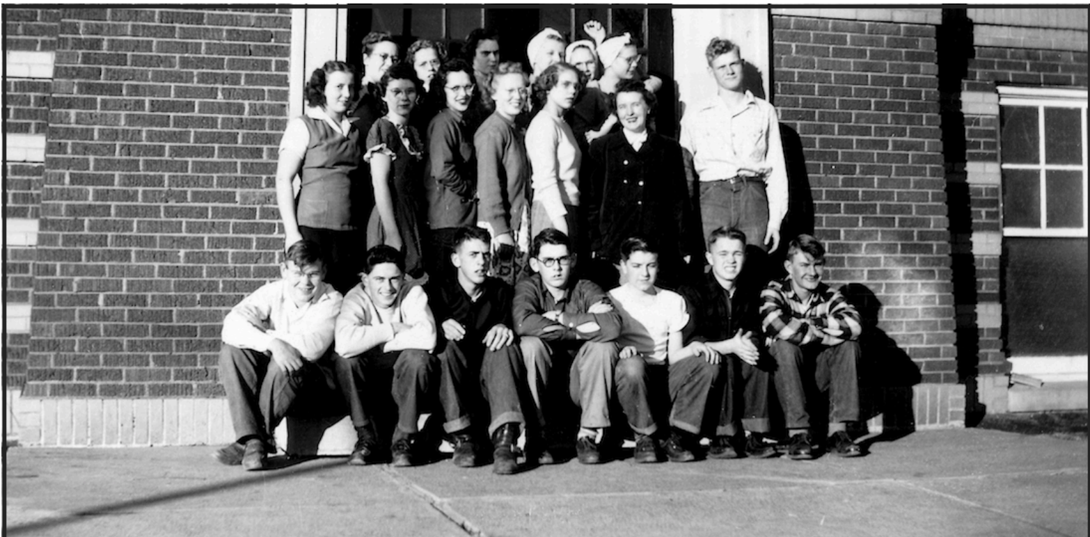
Staff of the Nicholite Student Newspaper — 1949