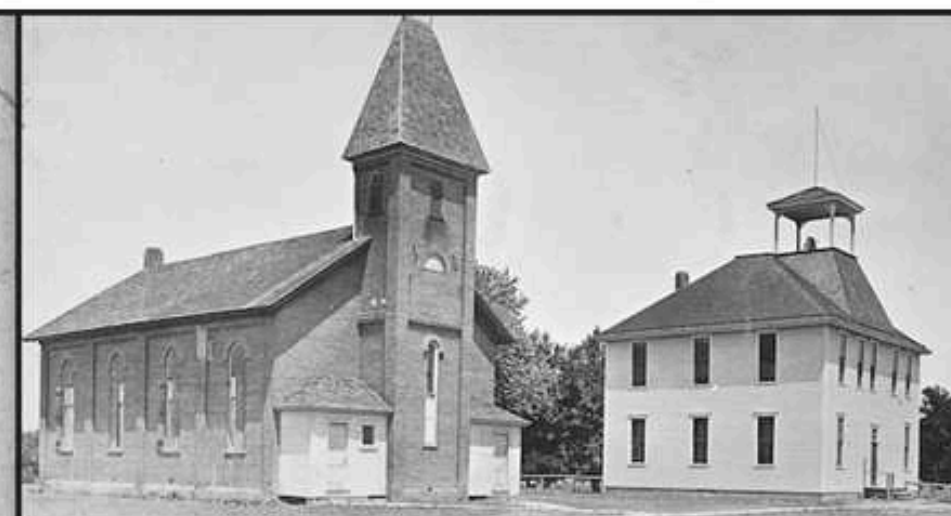
Nichols Christian Church — Nichols Public School Erected 1875 — Photo circa 1908 — Erected 1872