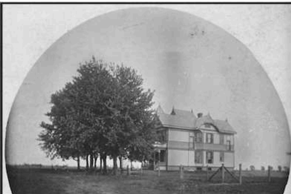
The Black House Erected circa 1896