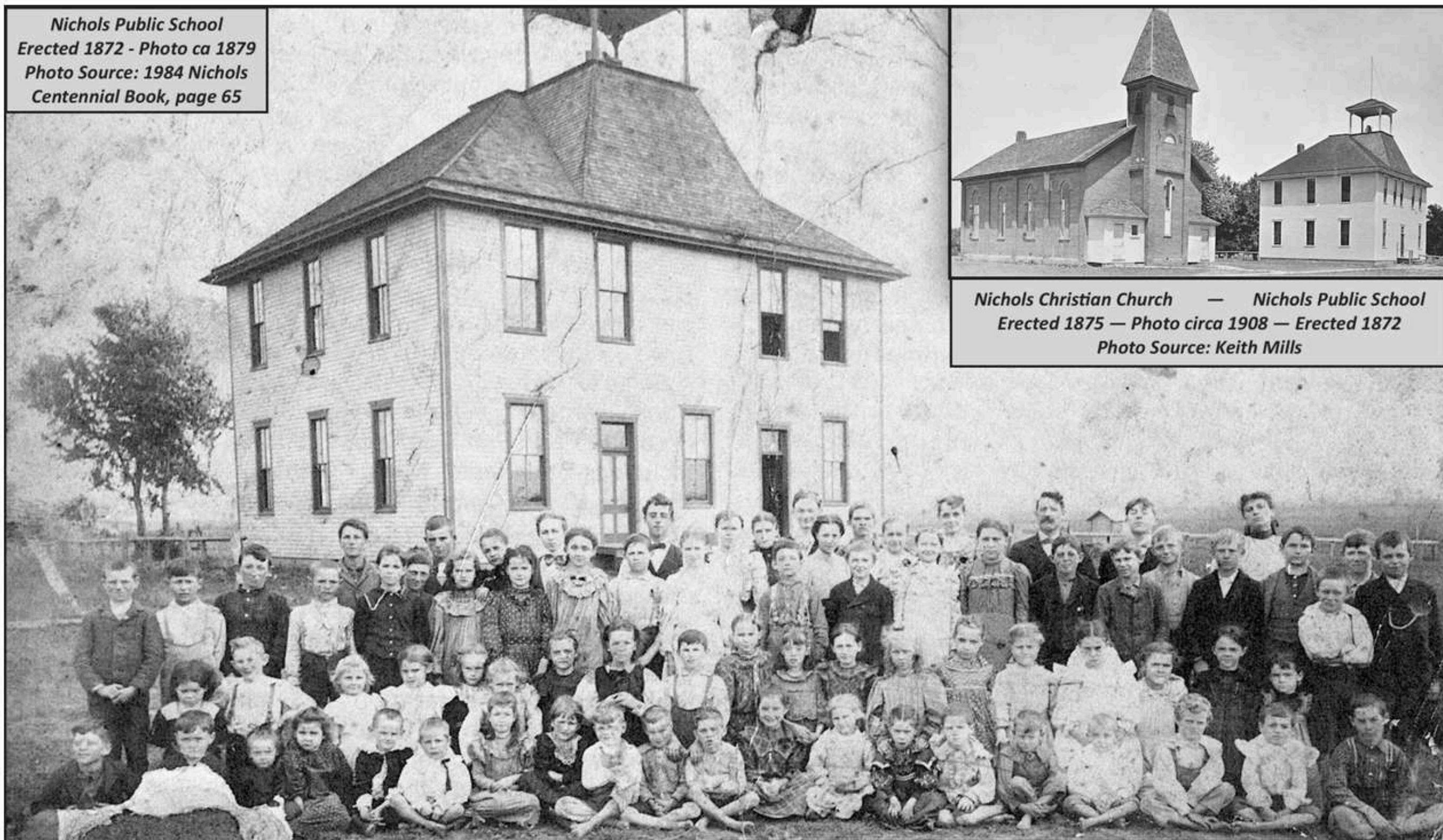
Nichols Public School Erected 1872 - Photo ca 1879